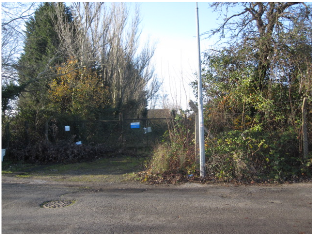
Eastern side of Gas Road opposite site