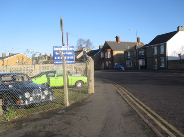
Existing footpath on The Causeway