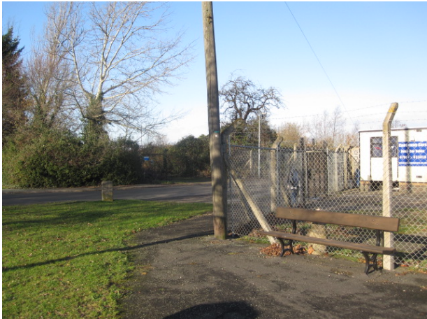
Existing provision looking north-east