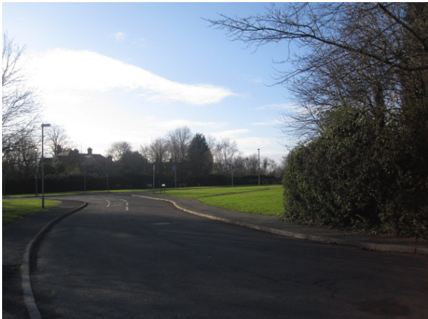
Existing footpath on western side of Gas Road