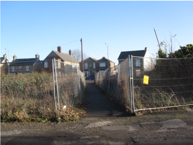
Footpath viewed from Gas Road