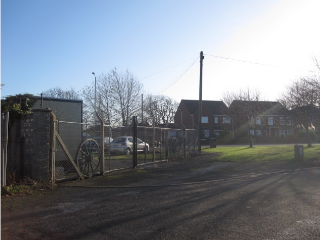
View of existing provision to South of site